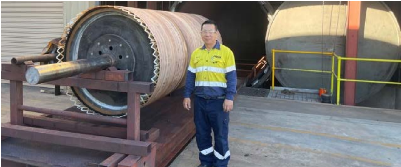
HOT VULCANISED PULLEY LAGGING INHOUSE CAPABILITIES AT PROK

The HVCL process guarantees no tile loss due to debonding, a 100% rubber tear bond to the pulley which ensures there is no chance of the lagging debonding: