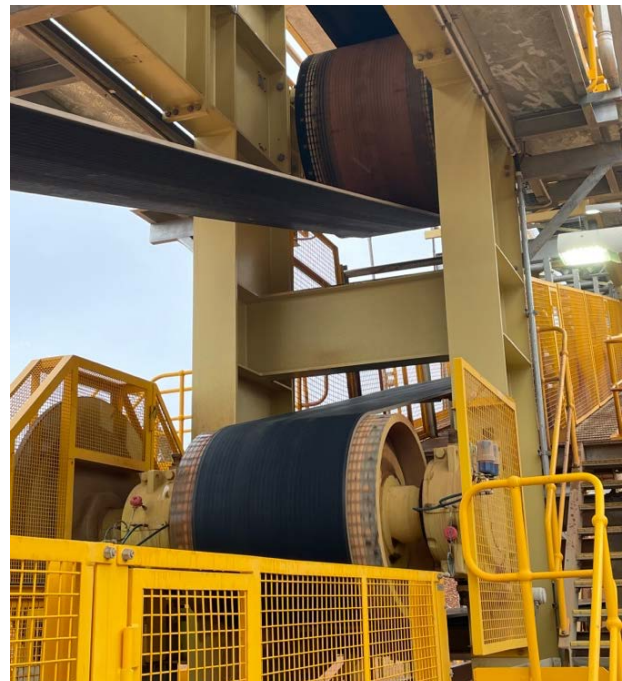
BRAKE AND BEND PULLEYS OPERATING SUCCESSFULLY WITH 12MM HOT VULCANISED CERAMIC LAGGING

To find out more about how Hot Vulcanised Ceramic Lagging can assist you with increased conveyor availability, please reach out to our Team of Experts.